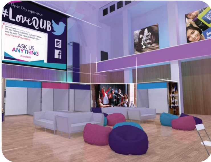
Arts, Humanities and Social Sciences Student Conversation Zone