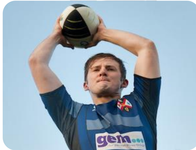
Sports Exhibition Front Lawns