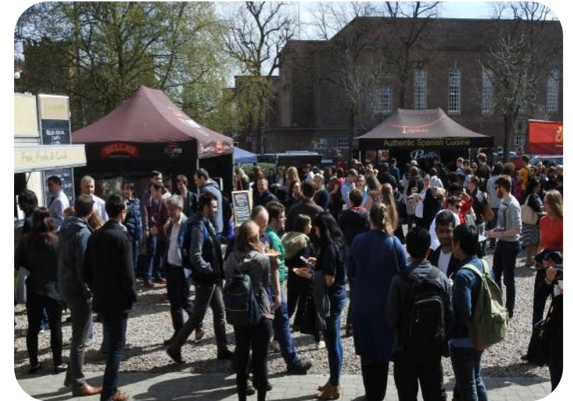
Engineering and Physical Sciences Interactive Zone